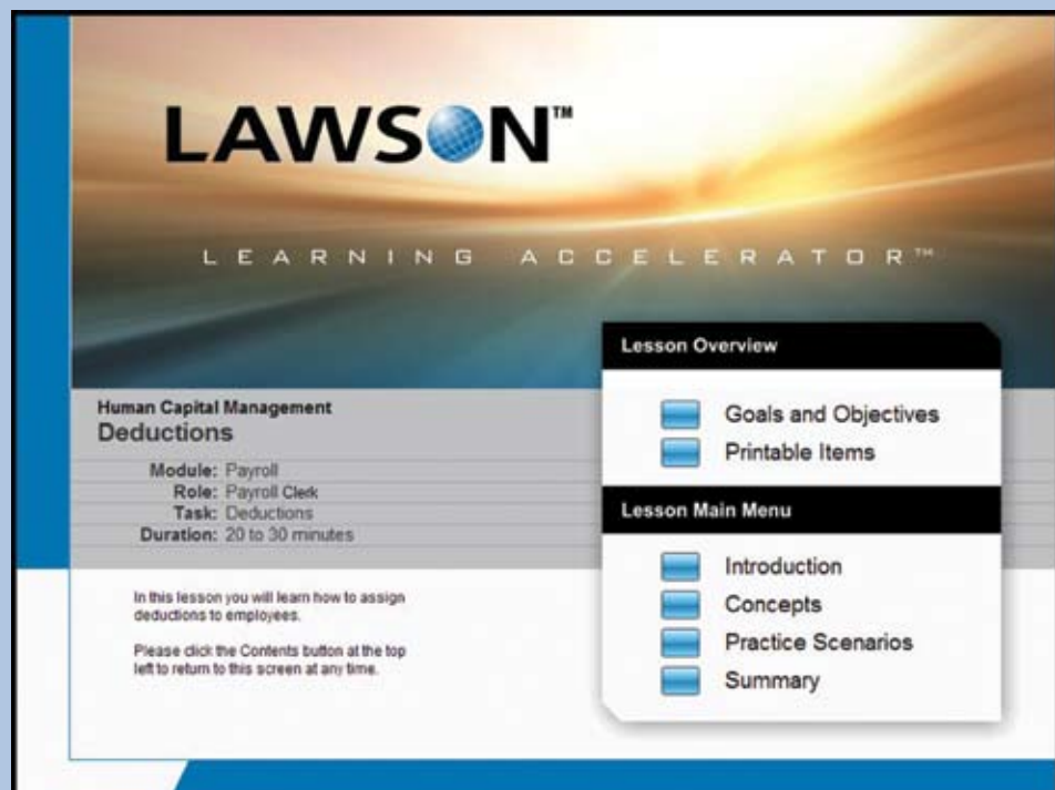
Role simulation screenshot — Lawson Human Capital Management Payroll Clerk.

Unlike traditional train-the-trainer approaches, which focus on one style of learning, Learning Accelerator is a comprehensive training program that allows learners to adapt to the style that best suits them.